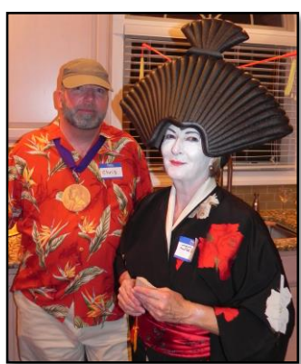
Wine Lovers Halloween Party