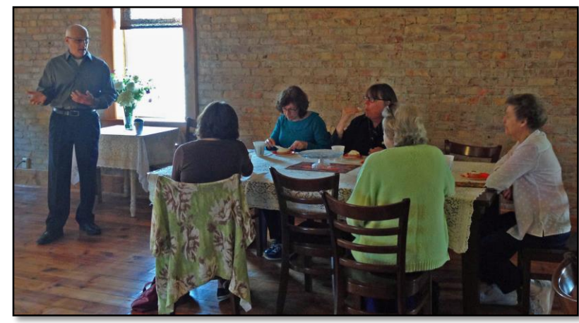
Onarga Academy's Cornerstone Cafe

Next we arrived at 'The Gathering', a unique