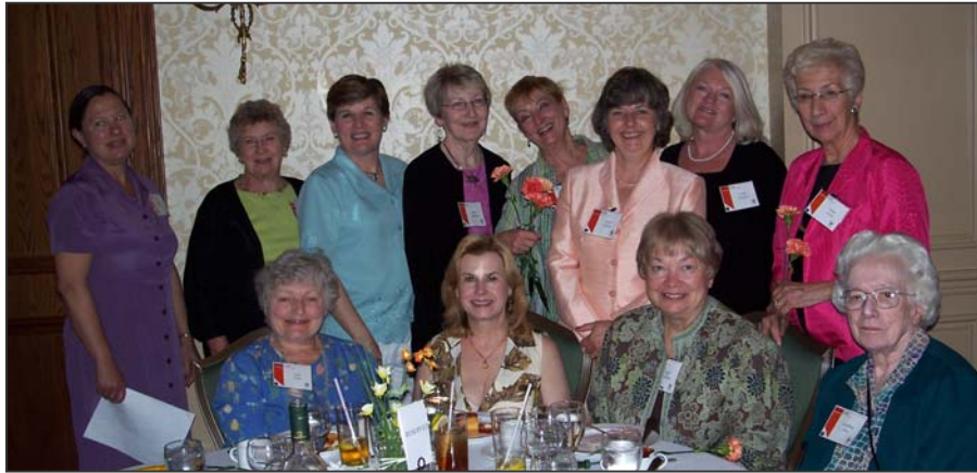
Past Presidents enjoying the Spring Luncheon