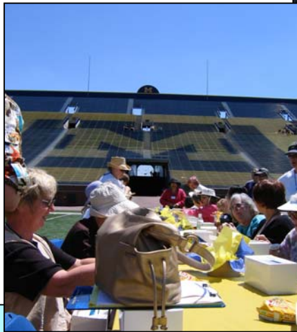
Lunch on the 50