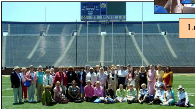
Conference attendees and guide