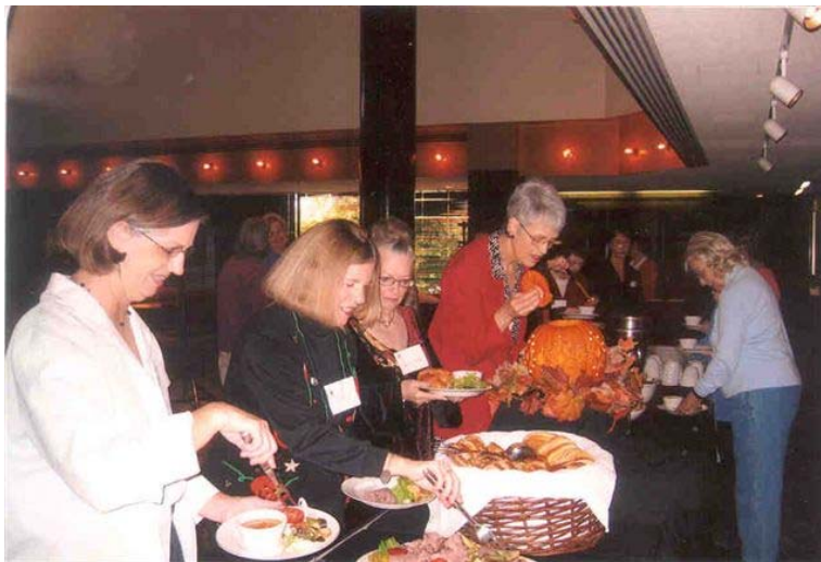
Dishing up at the scrumptious buffet