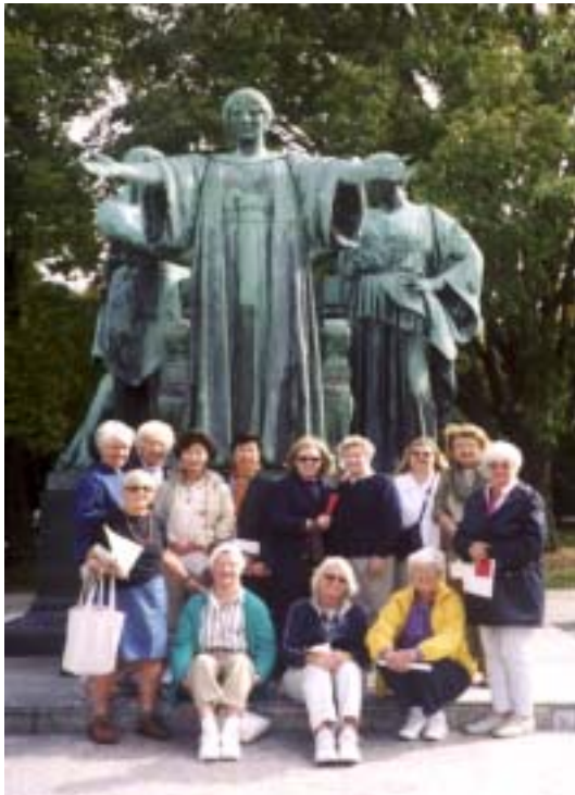
WC members gathered in front of the sculpture of Alma Mater.