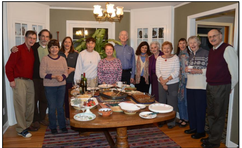
The final meeting of the Spanish Interest Group