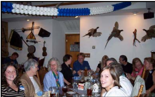
Oktoberfest at the Bayern Stube

Remember Reservations and Cancellations are a must!!