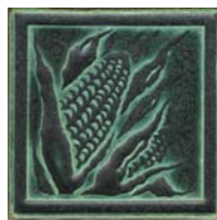
The UI Morrow Plots In Matte Finish Yellow or Green $35 Each