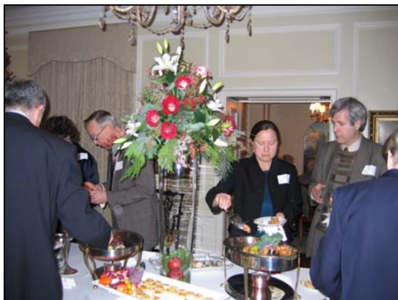
The festive buffet table and 2006 Decade contributors