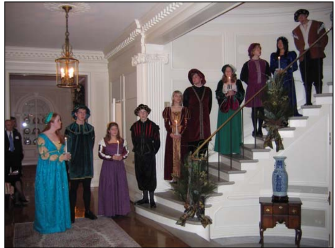
University High School Madrigals