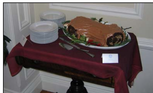
The traditional yule log