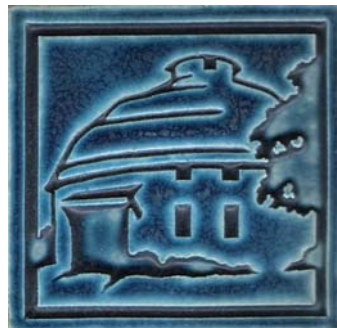
The Round Barn In Matte Finish Blue, Brown, or Oak $35 Each