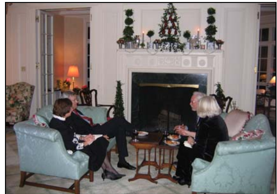
The Whites and the Pettigrews enjoying a chat