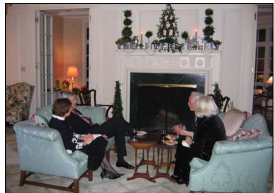
The Whites and the Pettigrews enjoying a chat