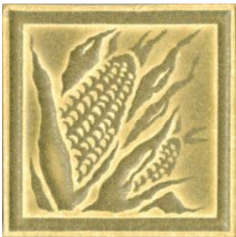
The UI Morrow Plots In Matte Finish Yellow or Green $35 Each