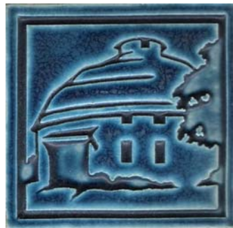
The Round Barn In Matte Finish Blue, Brown, or Oak $35 Each