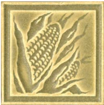
The UI Morrow Plots In Matte Finish Yellow or Green $35 Each